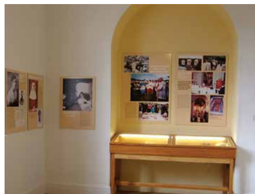
8 The Margaret Sinclair Museum , situated in the former baptistery at the rear of the church. The museum tells the story of Margaret's life in words and pictures and contains display stands showing items associated with Margaret Sinclair.