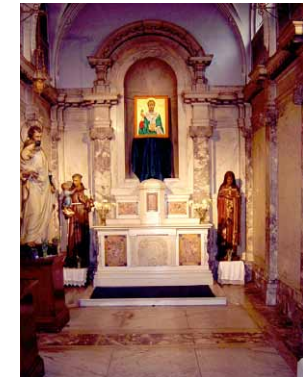
4 The Saints Chapel , situated to the right of the high altar. In the centre stands an icon of St Patrick, specially commissioned for the church.