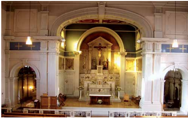
1 View of the Sanctuary from the choir-loft.