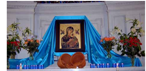
5 The shrine of Our Lady of Perpetual Help , situated on the right hand side of the nave.