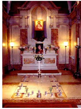
2 The Chapel of the Resurrection (incorporating the shrine of the Venerable Margaret Sinclair) is situated to the left of the high altar. Margaret Sinclair's tomb lies within the chapel.