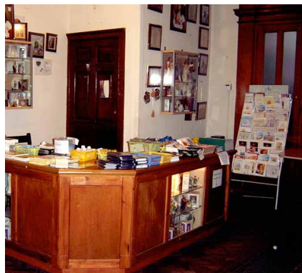
9 The Holy Shop with a large stock of cards, missals, rosaries, holy pictures, prayer books, first communion and confirmation gifts.