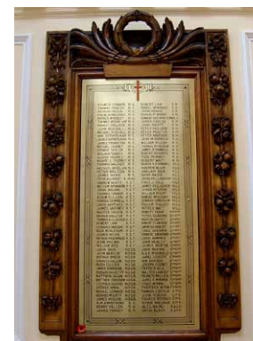
7 On the walls of the Memorial Room there are three plaques containing the names of members of the parish who died during the First World War.