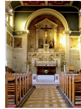
3 View of the Sanctuary from ground level.