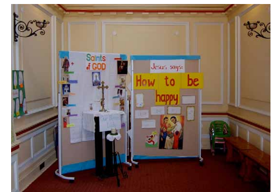
6 The Memorial Room is situated on the eastern side of the church. It is used on Sundays for the Children's Liturgy and at other times as a meeting room.